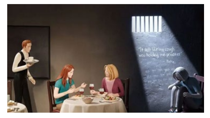
Insmed's social media campaign targeting healthcare professionals.

It was effective and award-winning, it increased the number of doctors who would test patients for NTM and it won gold in the Best Initiative for Nonconsumers at the MM&M Awards.