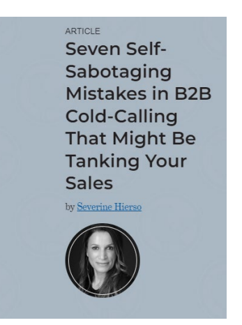
Guest posts are a great way to generate demand

It great for exposure and link-building to guest post on other marketing blogs. Post on a third-party platform to build your audience (check the fine print- guidelines and backlink policies to ensure you make the right choices).