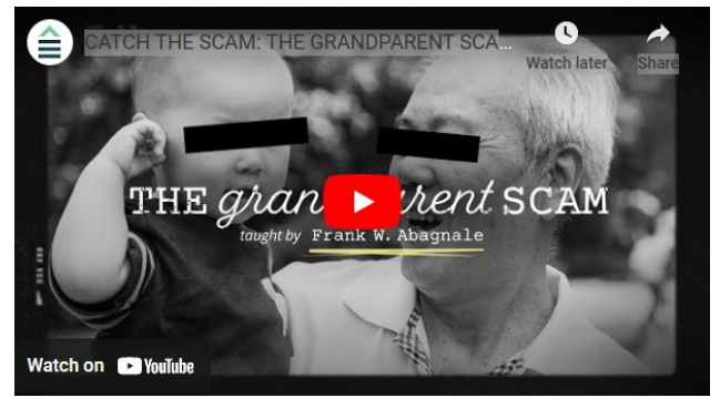
HomeEquity Bank 'Catch the Scam' campaign by Zulu Alpha Kilo