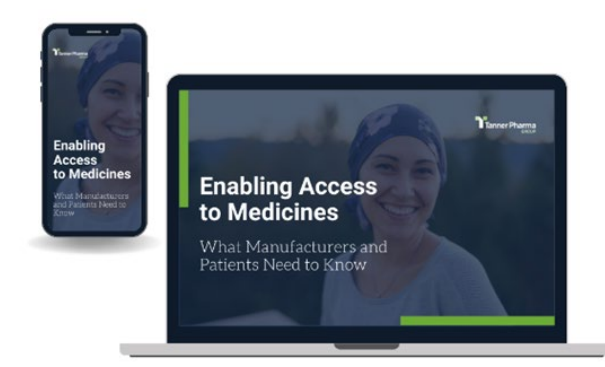
Tanner Pharma's 'Enabling Access to Medicines' Whitepaper

Create whitepapers, articles or interviews on trends- knowledge of trends is important to every sector of business- try interviewing subject matter experts on trending topics. (This works in multiple formats including videos, webinars, social media posts, etc.)